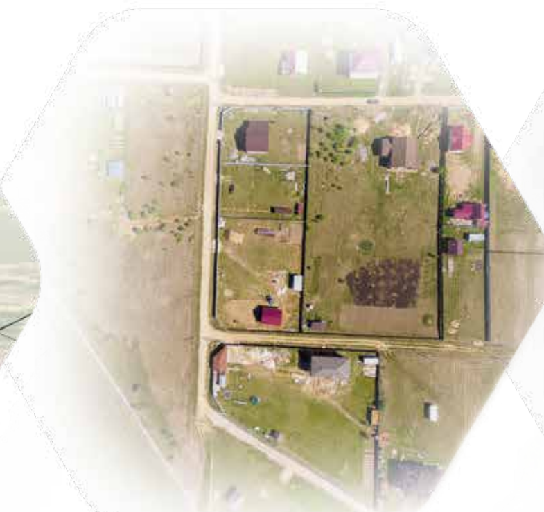
Land development and construction