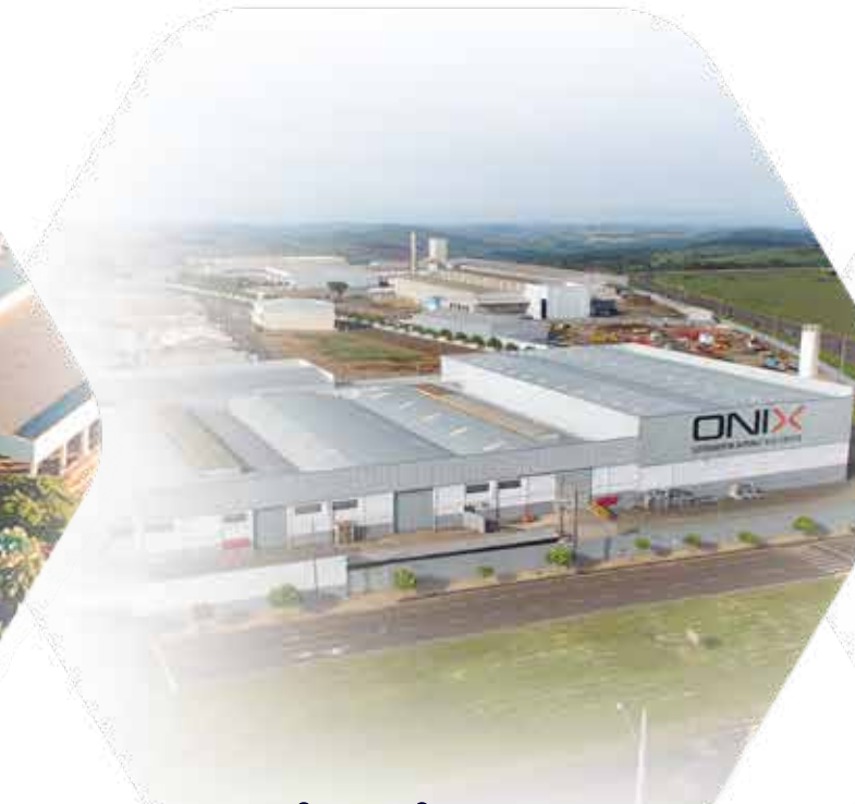
Distributors of electrical Equipment