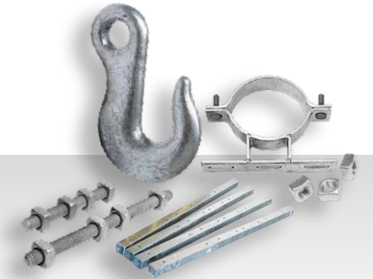
Pole line hardware