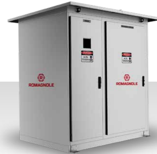
Metal clad switchgear