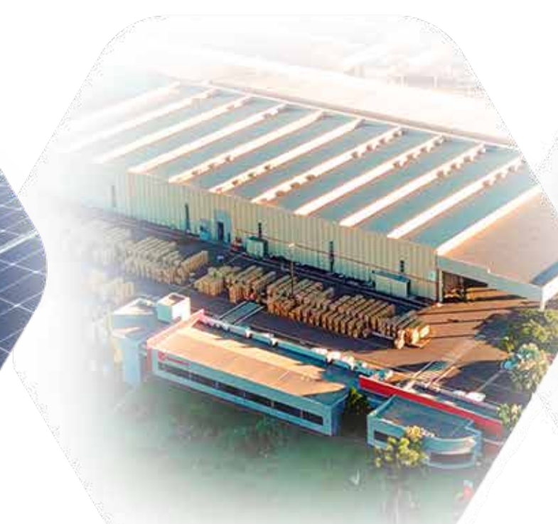
Industry and commercial facilities