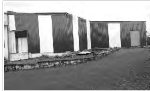
Mango Pack House at Sindhudurg

CONCOR's commitment to support education to those who are least privileged in society continued further by supporting 40 bright students towards preparation for higher studies in Eastern Uttar Pradesh belonging to poor families as well as in Delhi, where it supported operation and maintenance of a primary school run for slum children benefitting 250 such children.