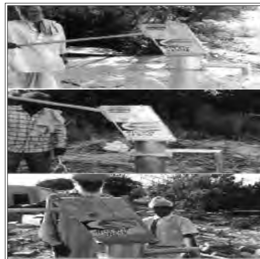
Handpumps in Lakhimpur, Khiri, Uttar Pradesh