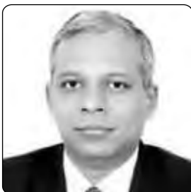
Director (Intl. Marketing & Operations)

During his tenure as CEO/GTIPL, he has taken various landmark initiatives towards improving productivity, efficiency and safety of the terminals. He has simplified various operating procedures in the terminal and pioneer in introducing paperless gate-transactions, which was a step towards ease of doing business. The Terminal has also consecutively achieved performance of 2 million TEUs p.a. and recognized as best Container Terminal by the maritime fraternity during last five years.