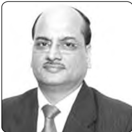
Director (Domestic Division)