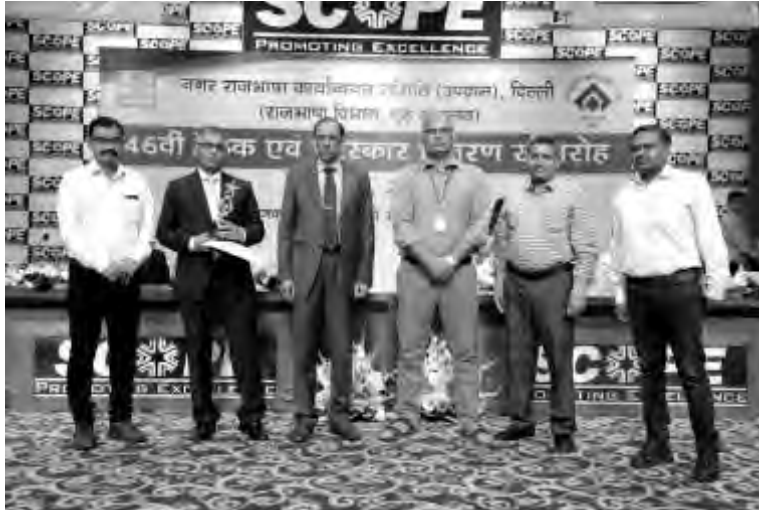
CONCOR conferred with Rajbhasha Shield

Total 100 employees including 23 from corporate office were given cash awards under CONCOR RAJBHASHA PURSKAR YOJANA 2016-17 for noting and drafting work in Hindi. On 24 th November 2017, Hindi Kahani Vachan Partiyogita was organized at Corporate Office under the aegis of Town Official Language implementation Committee (PSU), Delhi in which 18 officials from various PSUs participated. CONCOR was conferred with Rajbhasha shield for financial year 2016-17 by Secretary, Dept of Official Language, Govt. of India, for their excellent work in promoting official language, Hindi.