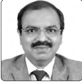
Chairman & Managing Director