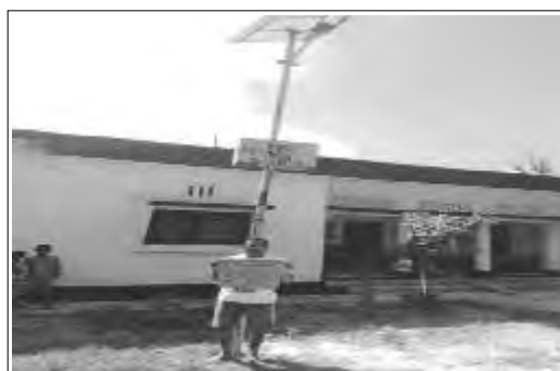
Solar electrification in Bhadohi and Shrawasti

Passenger amenities were upgraded at New Delhi and Vadodara Railway stations by providing water coolers, maintenance of track cleaning machines, solar electrification of platforms of New Delhi Railway station.