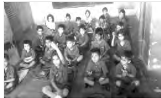
Support to slum children in Delhi

Enthused by the success of Perishable Cargo Centre at Ghazipur CONCOR completed the construction of another Perishable Cargo Centre at Rajatalabh Railway station in Varanasi in order to provide storage facility to farmers of this area with 400 MT storage capacity. The centre will be helpful to those who had no access to such storage facility resulting in wastage of vegetables in large scale in vegetable growing season.