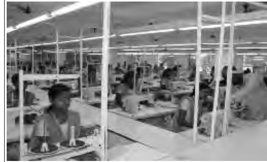
Skill development training at KISS, Bhubaneswar

Preventive Health camps continued to be organized like previous years at 25 major locations of CONCOR facilities benefiting approximately 50,000 stakeholders by organizing 77 health camps which have been able to create a mass awareness among CONCOR stakeholders towards basic health issues being faced by them.