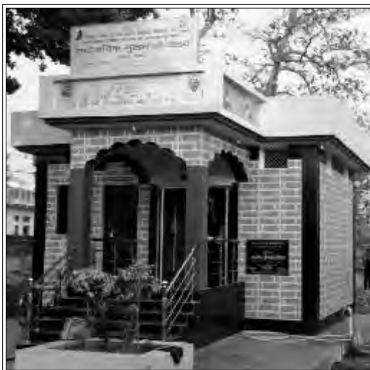
Community toilet in Ghazipur, Uttar Pradesh

To promote sanitation among masses, community toilet blocks were constructed in Jahanabad, Bihar and Ghazipur and Varanasi, Uttar Pradesh. Construction of school toilets in Kannur district of Kerala also got completed.