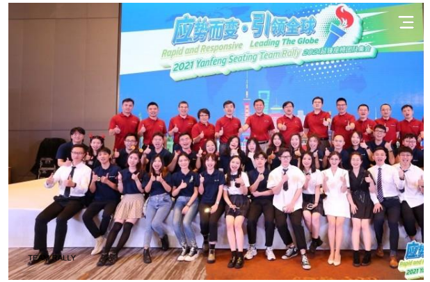
Ahead is a corporate social responsibility program launched in the company's 20th anniversary. It aims at creating economic value while bringing positive impact to our employees, customers, suppliers and local society with diverse public participation. By "Live with Harmony", "Live with Green" and "Live with Hope" to carry out corporate social responsibility.