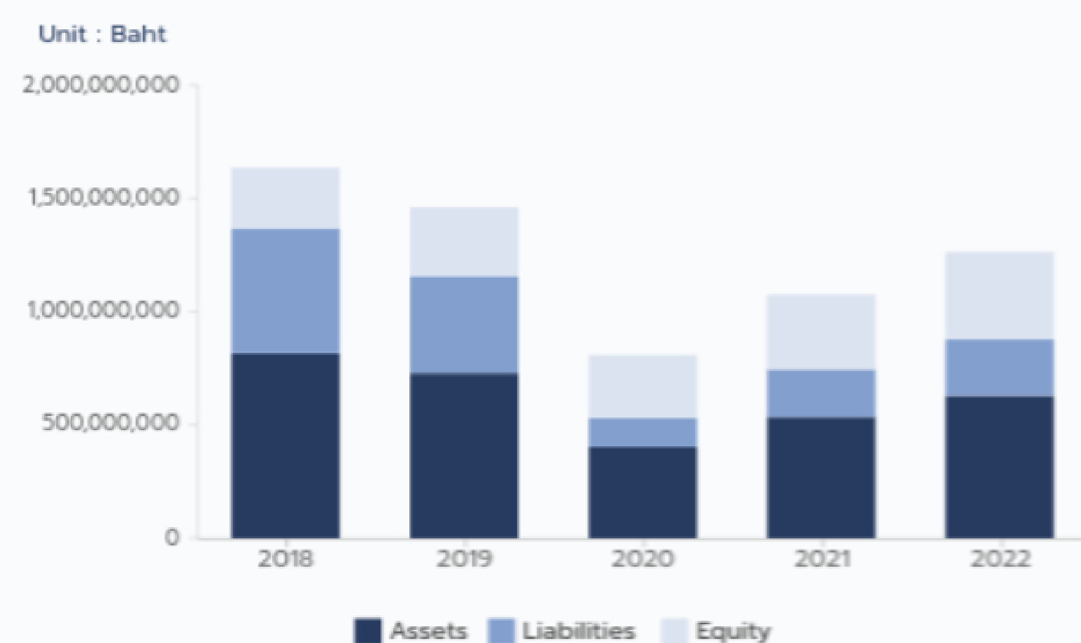
Balance Sheet Proportion