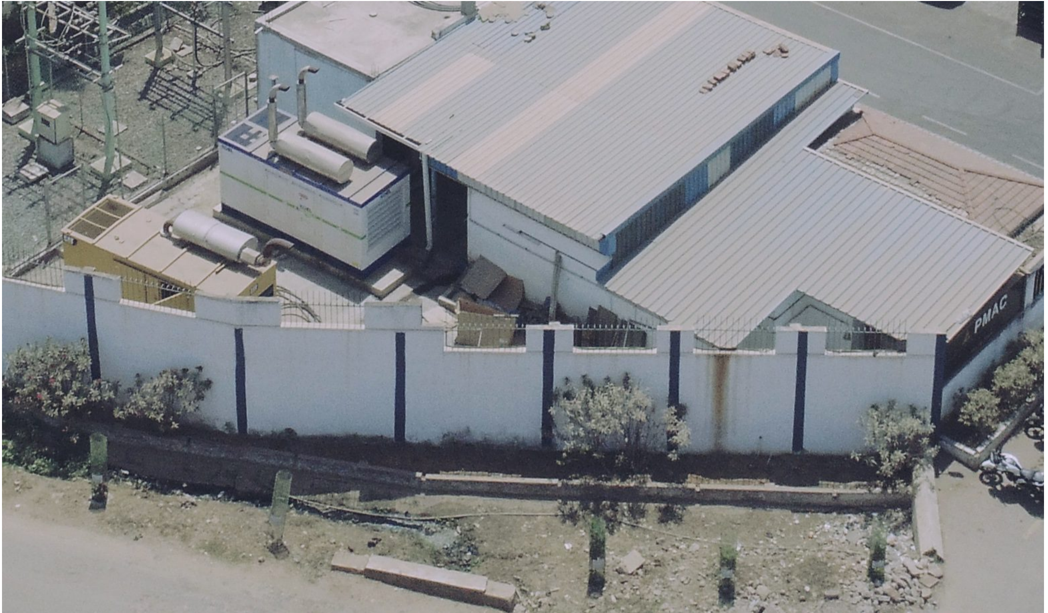
Precision Machine & Auto Components