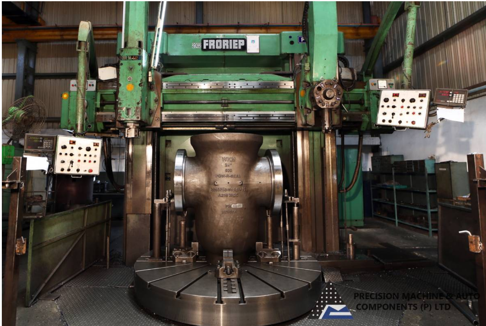
Vertical Turret Lathe