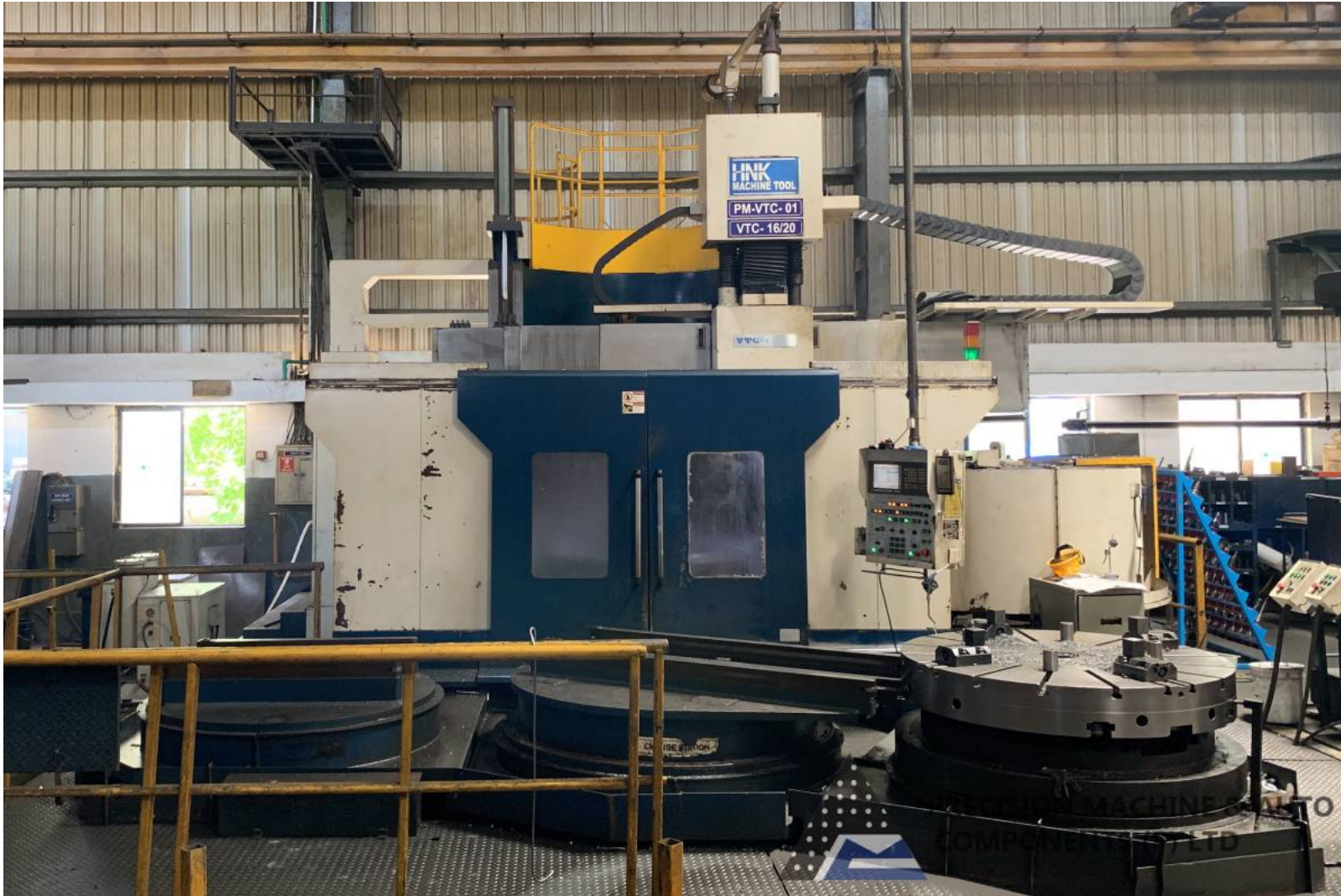
Vertical Turning Centre