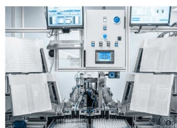
→ Clean room automatic packing device