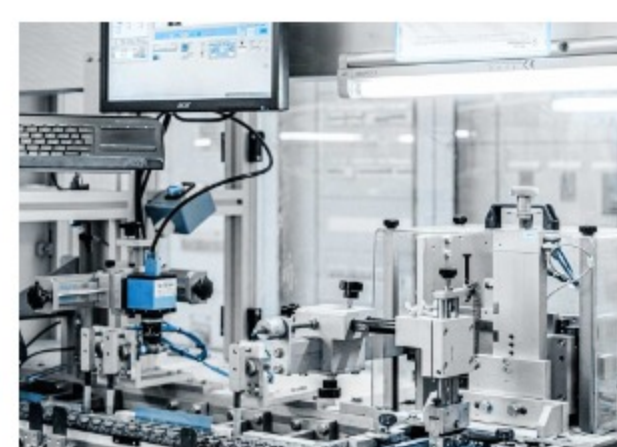
→ Ampoules transferring line