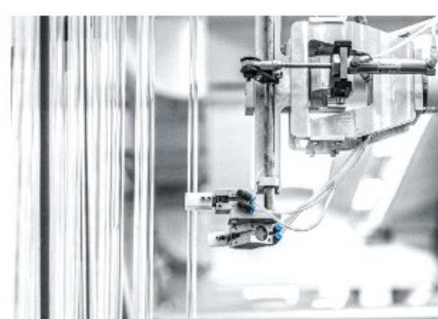
→ Glass tubing loader

✓ Since 1935 partnership with our customers is the most effective way to innovation