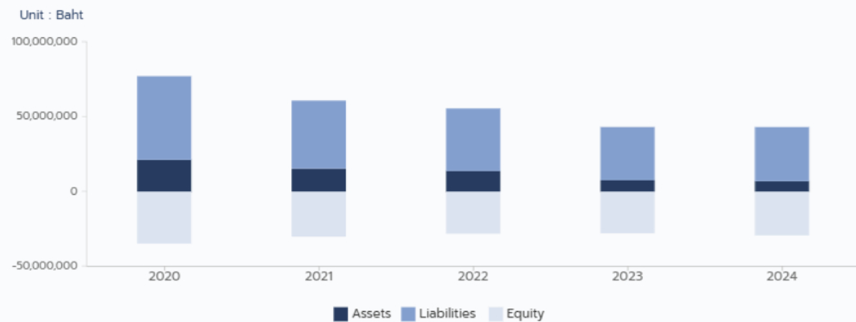
Balance Sheet Proportion